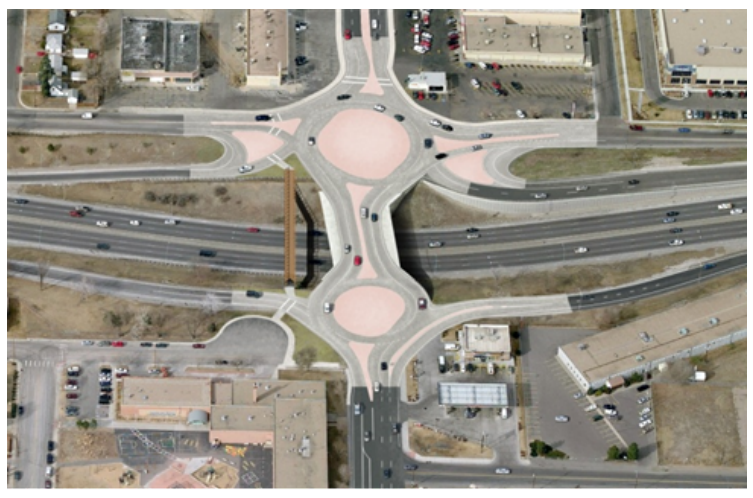
Rendering of the I-70/Pecos Street interchange after construction.

The partners on this $17.5 million project include CDOT, Federal Highway Administration (FHWA) and the Bridge Enterprise. The project team is comprised of CDOT, Wilson & Company (designer) and Kiewit Infrastructure Inc. (contractor).