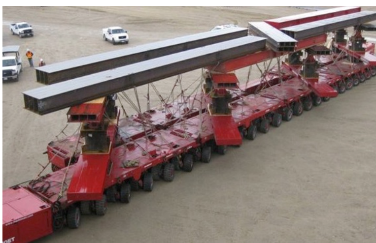
Example of a Self-Propelled Modular Transporters (SPMT)